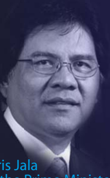
Dato' Sri Idris Jala Minister in the Prime Minister's Department Plenary Speaker