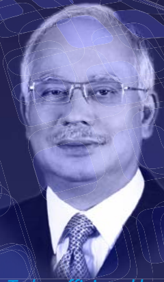
To be officiated by The Honourable Dato' Sri Mohd Najib Tun Razak Prime Minister of Malaysia