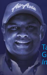
Tan Sri Dr Tony Fernandes Group CEO of AirAsia Berhad Inspirational Talk Speaker